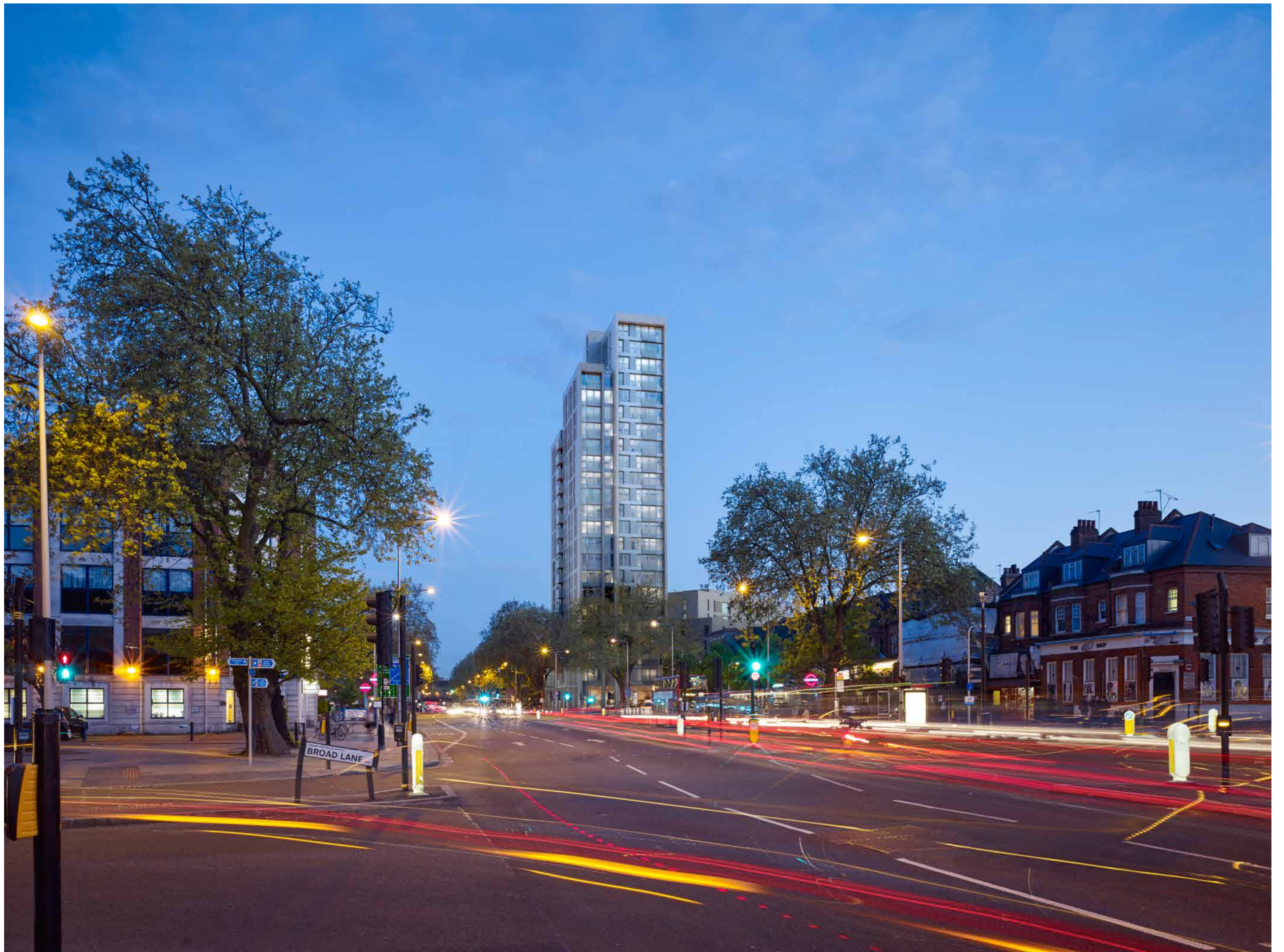
Illustrative view of Apex House looking south